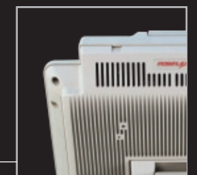
Patent aluminum die casting design for efficient cooling