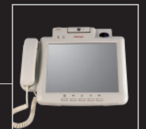
Wall mount option