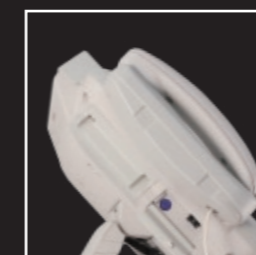
Push-open cover for power switch