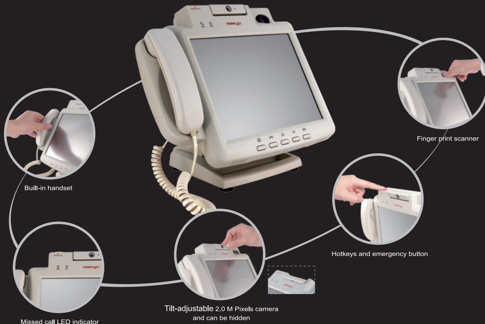
Missed call LED indicator

The KS-6910HS with soft outline caters for information and entertainment in nursing home, hospital, call center, healthcare-related and surveillance markets, etc.