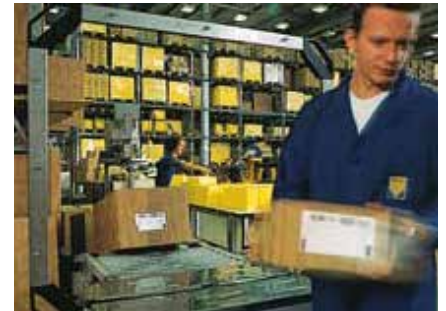
Manual Postal sorting