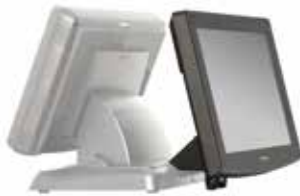
LM-8045X / TM-8045X