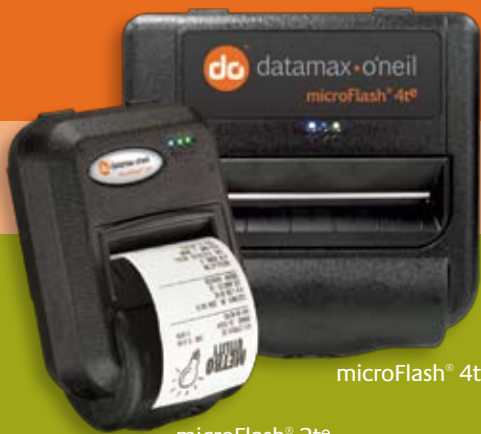
microFlash® 4t e